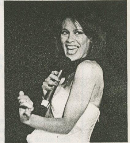
Marilyn McCoo performs a Disney melody at the tribute.