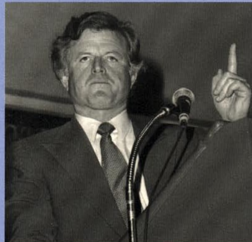
Senator Edward M. Kennedy speaking at a 1978 special luncheon hosted by Public Counsel